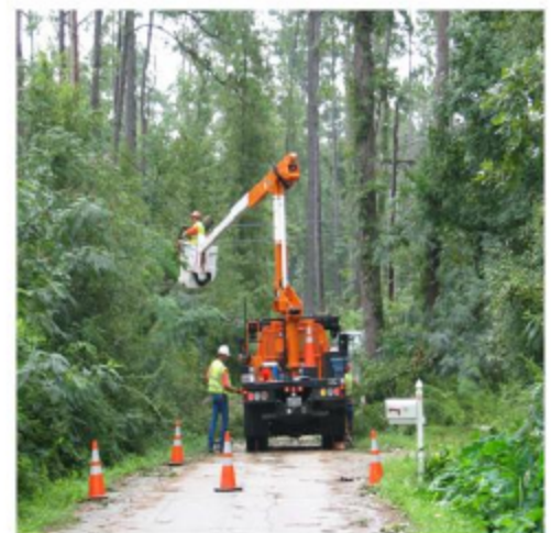
Out-of-state utility workers repairing power lines on Magnolia Gardens Dr. on September 5, 2008